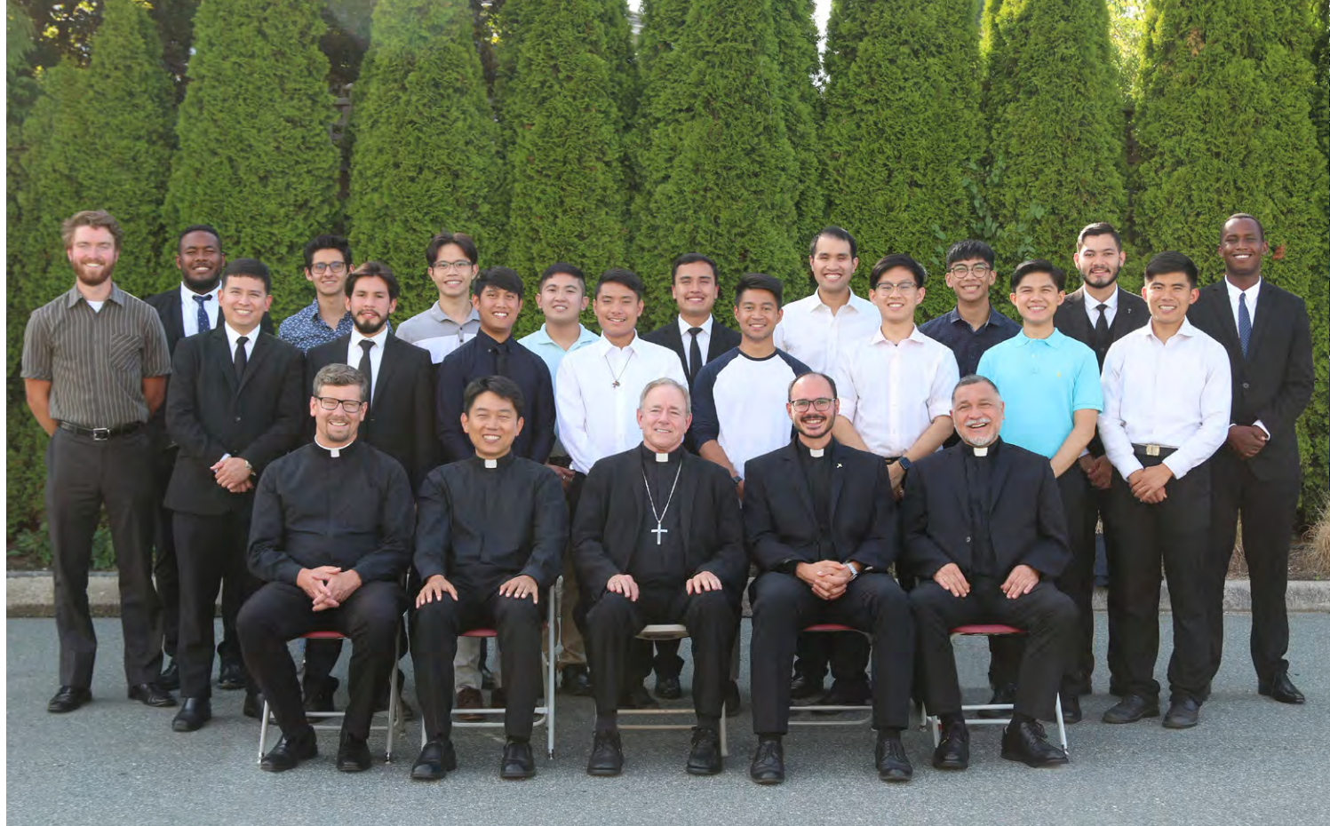
SEMINARIANS VISITING ST. MARY'S INDIAN RESIDENTIAL SCHOOL IN MISSION