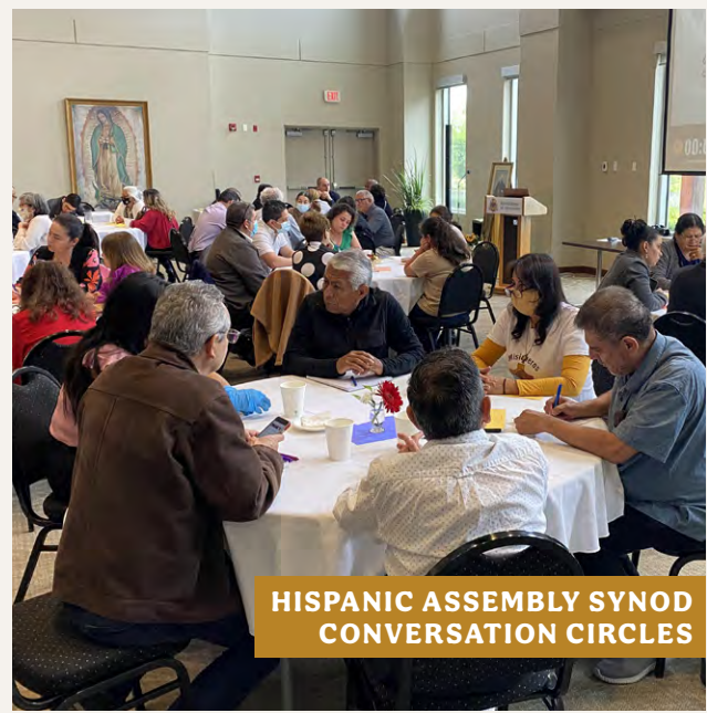
HISPANIC ASSEMBLY SYNOD CONVERSATION CIRCLES