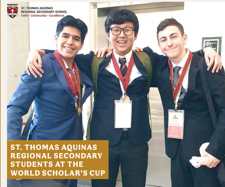
ST. THOMAS AQUINAS REGIONAL SECONDARY STUDENTS AT THE WORLD SCHOLAR'S CUP