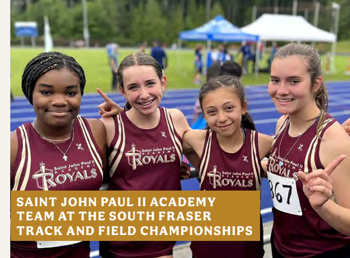
SAINT JOHN PAUL II ACADEMY TEAM AT THE SOUTH FRASER TRACK AND FIELD CHAMPIONSHIPS