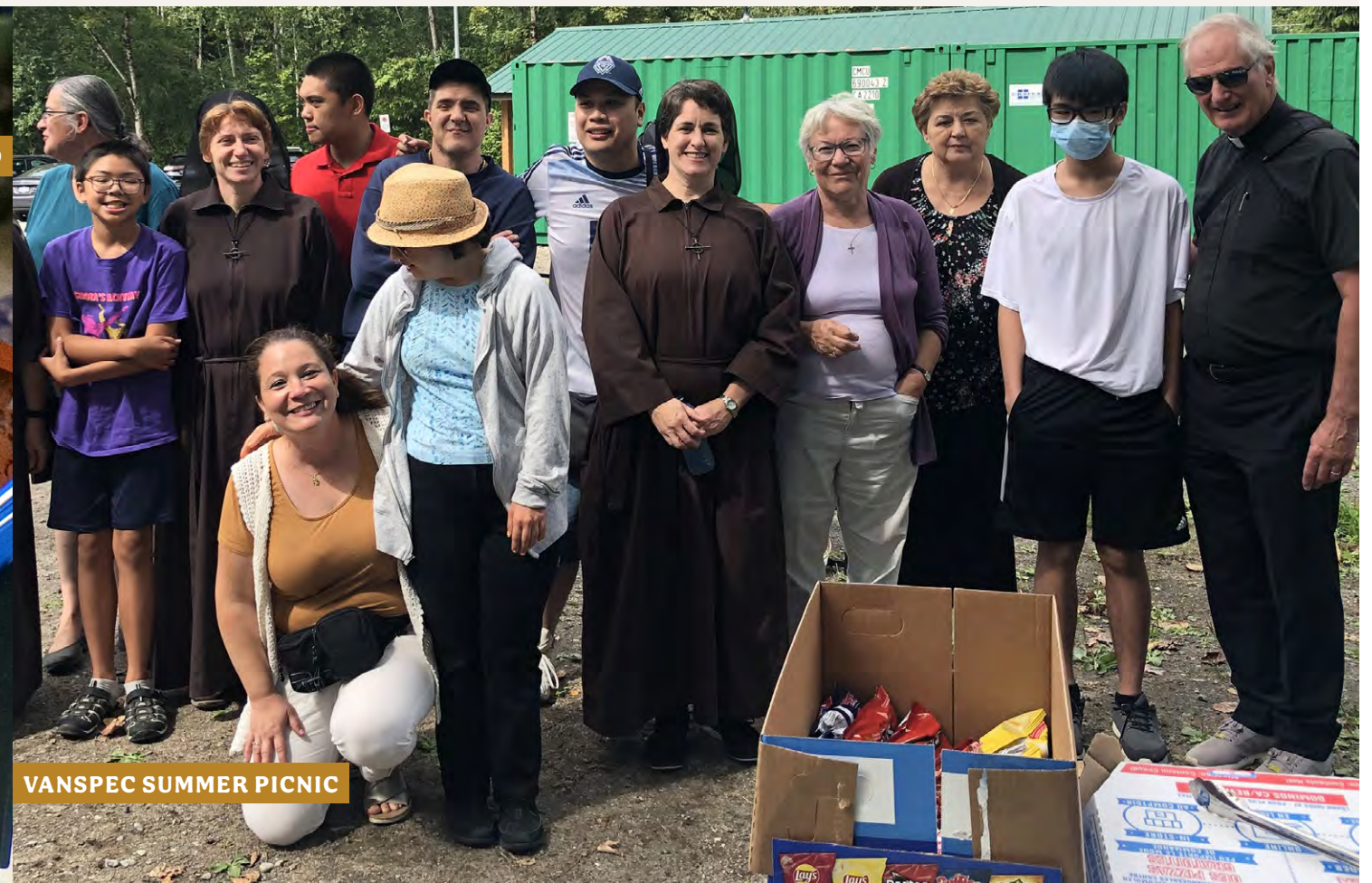
VANSPEC SUMMER PICNIC