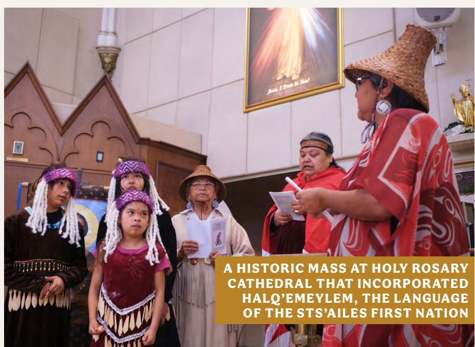
A HISTORIC MASS AT HOLY ROSARY CATHEDRAL THAT INCORPORATED HALQ'EMEYLEM, THE LANGUAGE OF THE STS'AILES FIRST NATION