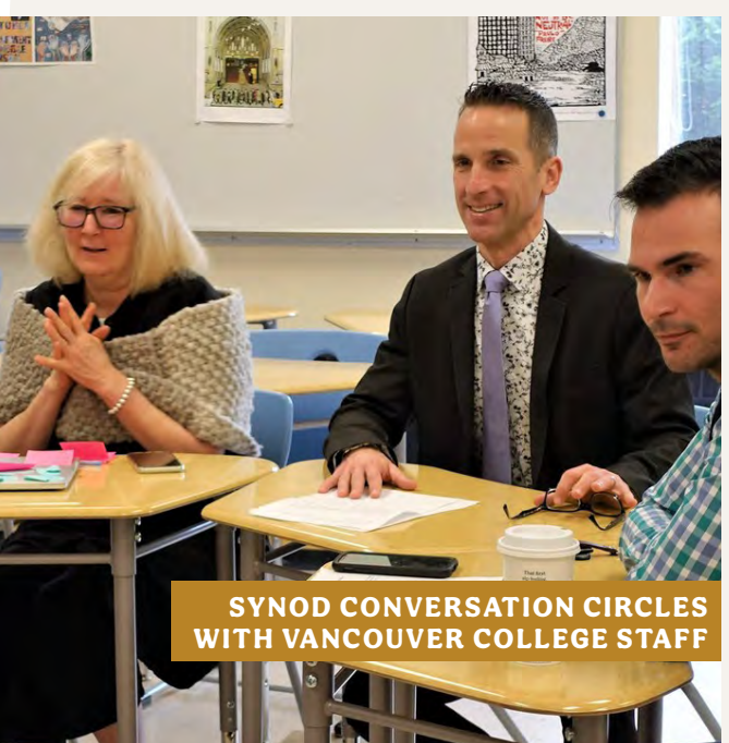
SYNOD CONVERSATION CIRCLES WITH VANCOUVER COLLEGE STAFF