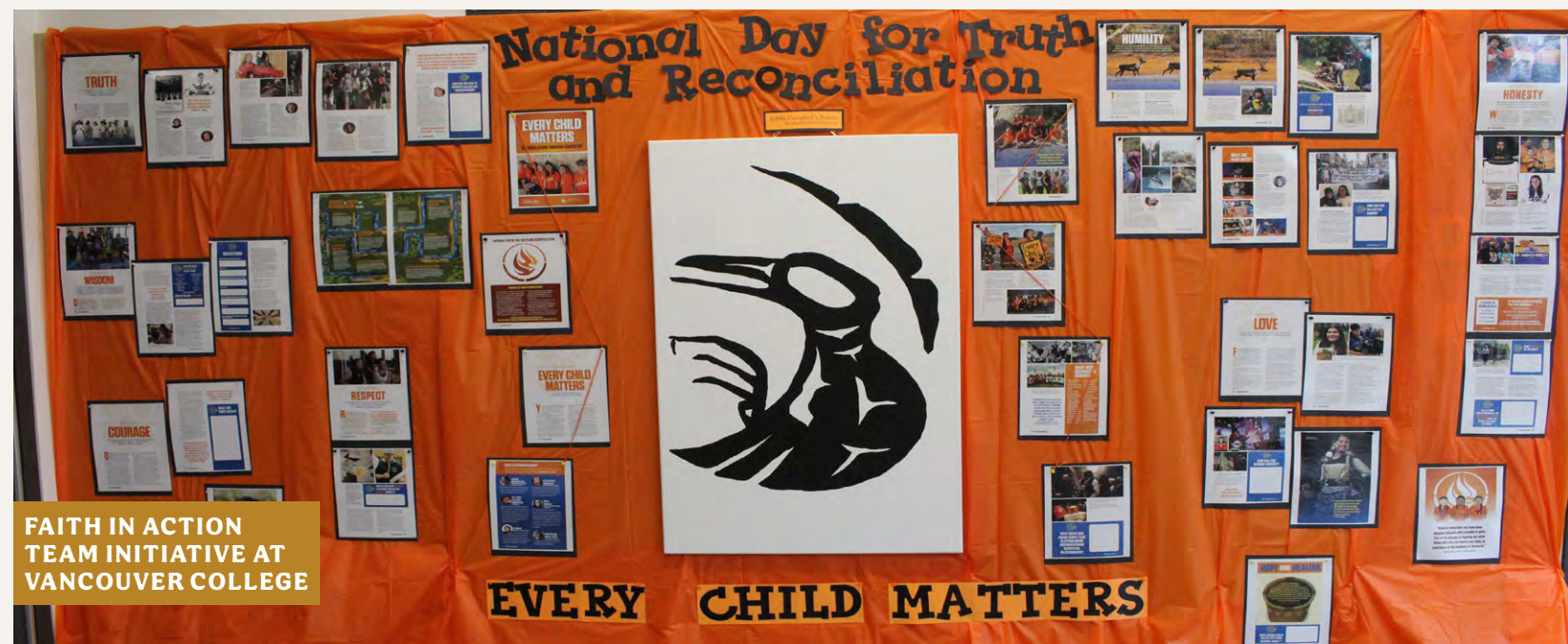
FAITH IN ACTION TEAM INITIATIVE AT VANCOUVER COLLEGE