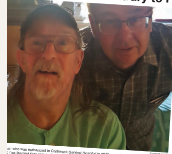
A man who was euthanized in Chilliwack (General Hospital) in 2019 even though his family said he was not ready to die.

ered euthanasia contrary to Fraser Health policy, B.C. Catholic investigation finds