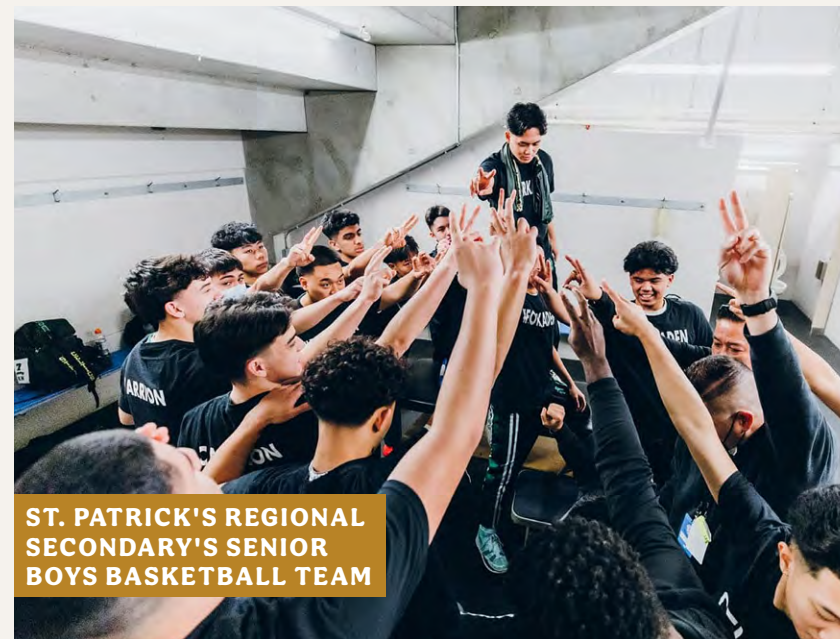
ST. PATRICK'S REGIONAL SECONDARY'S SENIOR BOYS BASKETBALL TEAM