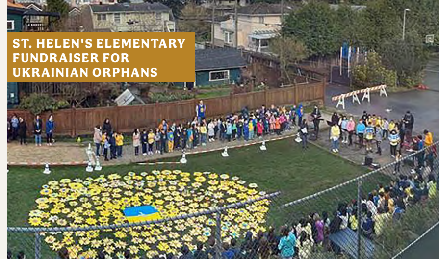
ST. HELEN'S ELEMENTARY FUNDRAISER FOR UKRAINIAN ORPHANS