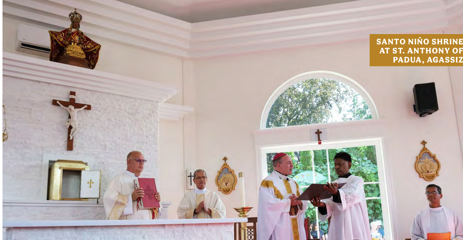
SANTO NIÑO SHRINE AT ST. ANTHONY OF PADUA, AGASSIZ