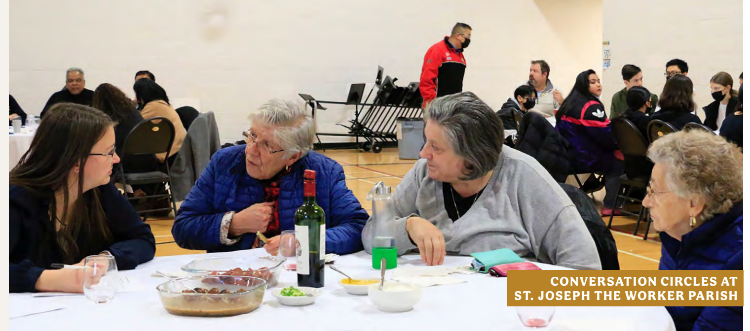
CONVERSATION CIRCLES AT ST. JOSEPH THE WORKER PARISH

Despite the considerable challenges posed by the COVID-19 pandemic, the Archdiocese of Vancouver completed its diocesan phase for the Synod on Synodality in less than a year. The response from Vancouver’s Catholic community was robust and enthusiastic, with more than 5,000 people and 87% of parishes participating. From October 2021 through June 2022, an eleven-person committee guided coordinators and participants as they gathered in small groups to share, listen, pray, and reflect together.