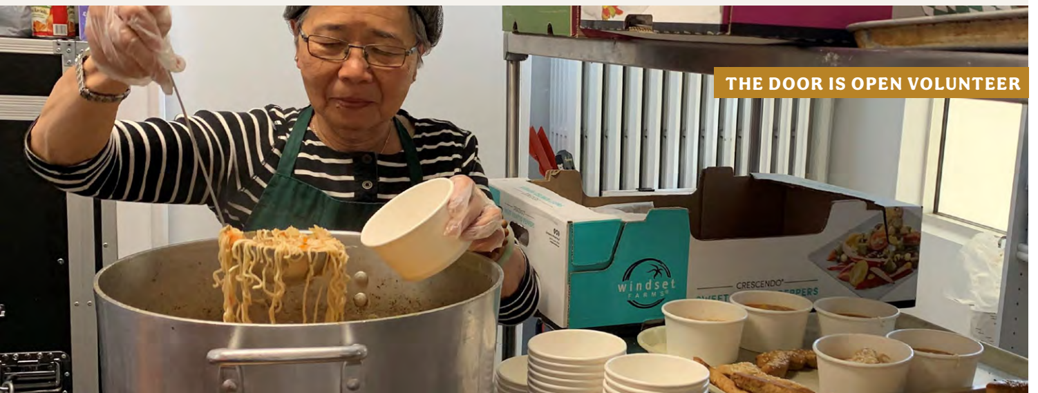
THE DOOR IS OPEN VOLUNTEER