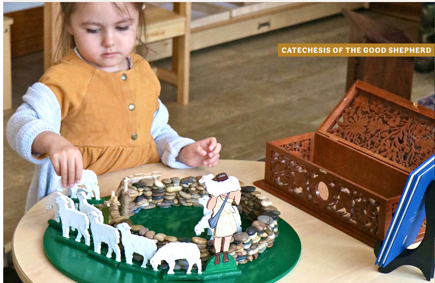
CATECHESIS OF THE GOOD SHEPHERD