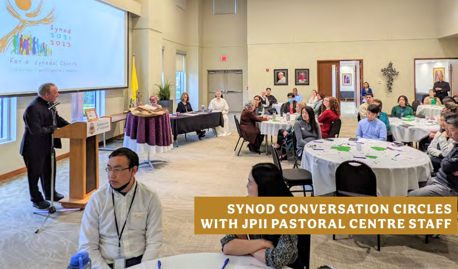
SYNOD CONVERSATION CIRCLES WITH JPPI PASTORAL CENTRE STAFF