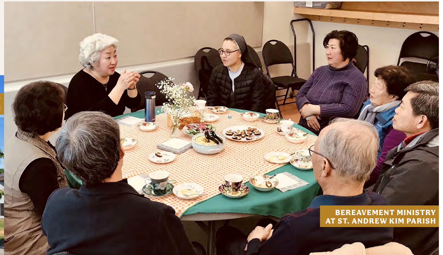
BEREAVEMENT MINISTRY AT ST. ANDREW KIM PARISH

Inspired by Korean Catholic traditions of burial, the bereavement ministry at St. Andrew Kim in Surrey draws on a large pool of laypeople to accompany and care for those in need of hospice and funeral care. The Hospice Committee visits the dying, arranges Anointing of the Sick, encourages relational healing among families, and provides post-funeral follow-up to care for grieving family members. The Funeral Committee visits the deceased, assists with funeral arrangements, prays the Psalms for the Dead (Yeondo), and provides support through the vigil, funeral, and burial processes.